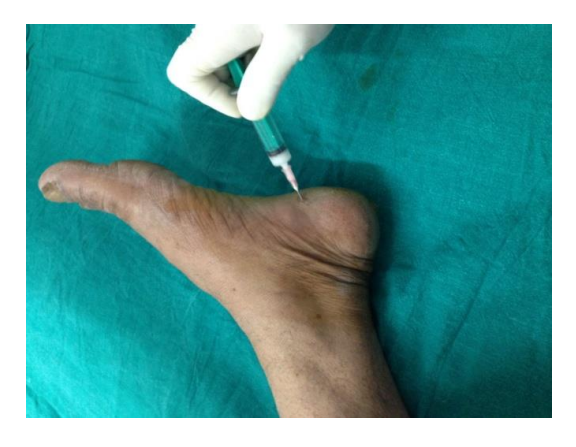
Figure 3: Local steroid injection to heel.

Final assessment was done at the end of 6 weeks and the results were analysed. The Numeric Rating Scale (NRS-11) is an 11-point scale for patient self-reporting of pain was used in our study for evaluation.