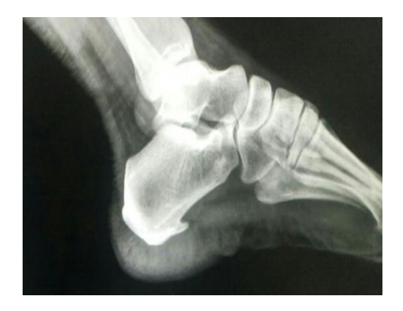
Figure 1: X-ray of patient with plantar fasciitis with calcaneal spur.

In our study we had included 50 patients between the age group of 25 and 50 years. 25 patients were treated by corticosteroid injections and another 25 by chiropractic therapy. Patients who had already undergone treatment for the same were excluded from the study. Patients were evaluated at 4 intervals including the initial assessment before the start of treatment. The patients were then evaluated at 2^{nd} , 4^{th} , and 6^{th} week. The total duration of the treatment was 6 weeks.