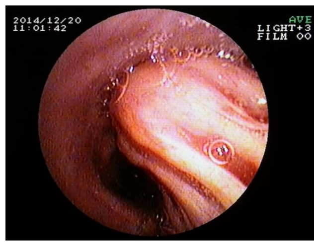
Fiber optic bronchoscopy showing partially obstruction of left main bronchus.

The chest radiography was abnormal in patients with features of fibrosis, fibrocavity with volume loss with ipsilateral mediastinal shift due to past history of tuberculosis, mass like lesion was present in 5 patients (Figure 1). HRCT chest in most of the patients showed endobronchial obstruction either partially or completely with volume loss and in homogenous consolidation (Figure 2).