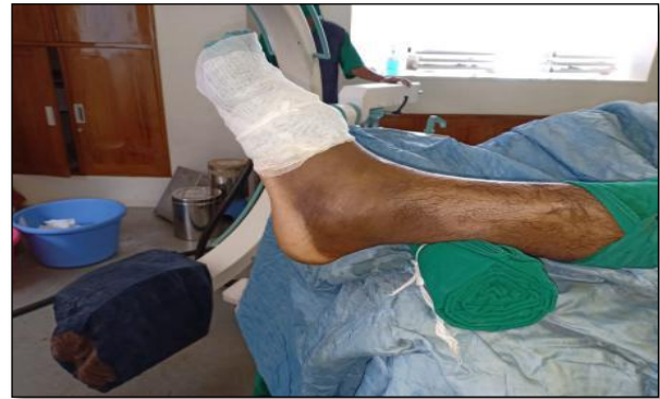
Figure 1: patient positioning.

punch and mallet and provisionally fixed with multiple 1.8mm K-wires.