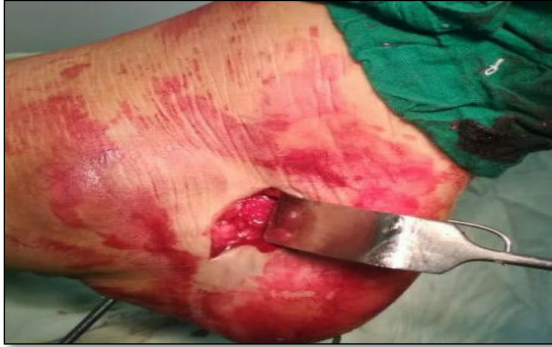
Figure 4: Impacted bone iliac crest tricortical bone graft.

prevent future “kashiwagi” syndrome. 9 After insertion of iliac crest bone graft and confirming articular reduction under c arm in lateral and axial views it was fixed with 1.8mm k wire or 2mm Steinman pin was inserted from calcaneal tubercle passing through the graft and distally fixing within the cuboid bone (Figure 4).