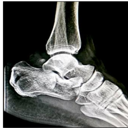
Figure 6: Pre-op.

Functional outcome of patients was evaluated using American Orthopaedic Foot and Ankle Score 10 (AOFAS) which was calculated at 2 weeks, 6 weeks, 3 months and 6 months post op and at 2 years. 10