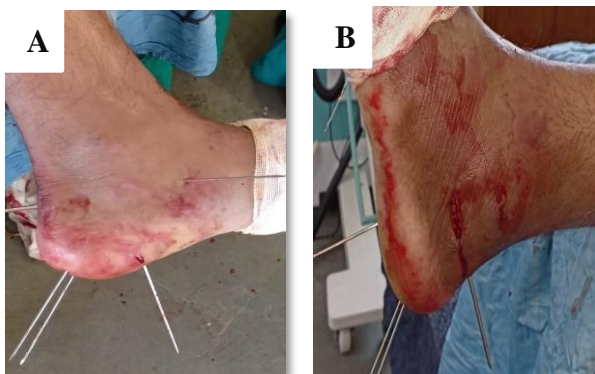
Figure 5: Intraoperative images. A): Medial, B): Lateral.

A second 1.8mm k wire was inserted from plantar surface of calcaneum passing again through the graft pointing towards the calcaneal Bohler’s angle. Few more K-wires are inserted for additional fixation and maintenance of elevated articular fragments. One 2mm k wire was passed from lateral to medial side just below the sustentaculum tali so as to support it additionally (Figure 5A,5B).