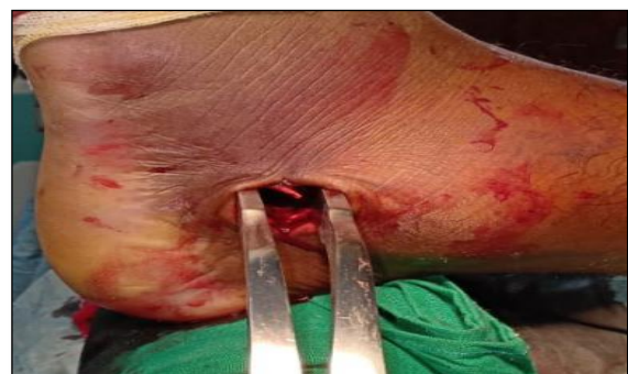
Figure 3: Lamina spreader.

After achieving articular elevation of calcaneum, size of bony window in lateral calcaneal cortex was measured and same size of tricortical iliac autologous bone graft was harvested from ipsilateral side. Lamina spreader was removed and graft was punched lateral to medially within the created window (Figure 4) in lateral calcaneal wall so that it supports all elevated facetal fragments. Manual pressure was applied medially and laterally below the sustentaculum to reduce the width of calcaneum and