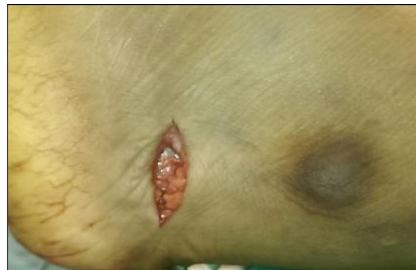
Figure 2: Incision.