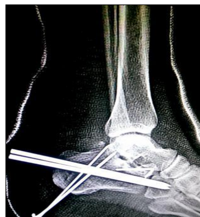
Figure 8: Immediate post-operative lateral view.