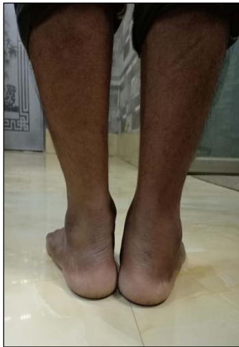
Figure 9: Clinical picture.