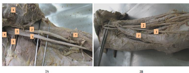
Figure 2A & 2B: Showing dissection of the gluteal region, back of thigh and popliteal fossa.

1 - Sciatic nerve, 2 - Tibial nerve, 3 - Common peroneal nerve,