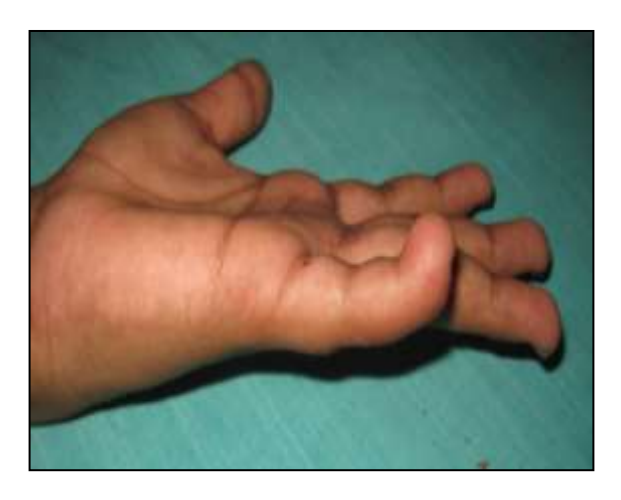
Figure 6: Camptodactyly of left little finger.