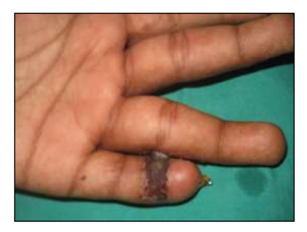
Figure 7: After release and cross finger flap cover.

The resulting raw area was covered with a cross finger flap from the ring finger. (Figure 4) Flap inset given with 4-0 nylon sutures and the secondary defect was resurfaced with a SSG. Post-operative was uneventful and the sutures and the K-wire were removed two weeks later. (Figure 5)