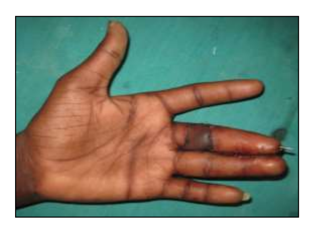
Figure 4: After cross finger flap cover.

The antenatal period was uneventful. On examination, there was a flexion deformity of the left middle finger at the PIP joint with inability to fully extend the joint passively. (Figure 1) X-ray was unremarkable with a narrowing of the PIP joint space and periarticular changes. A diagnosis of camptodactyly was made and we proceeded for exploration. Under axillary block and tourniquet control, an incision was made at the PIP joint level and slowly dissected. The skin and subcutaneous tissue were contracted with the FDS as a contracted band. (Figure 2) The FDP was intact and the neurovascular bundle was shifted anteriorly. The involved skin, soft tissue and the