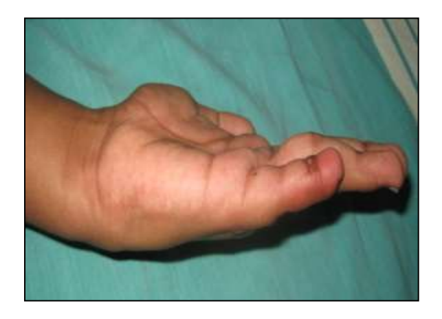
Figure 8: Late post-operative picture showing good result.

13 year old male presented to us with camptodactyly of the left little finger since birth. (Figure 6) He too was explored under anaesthesia. The contracture was gradually released and the position was stabilized with 1.25mm K wire. Post release, the defect of size 1 \times 0.5 cm covered with cross finger flap from ring finger. (Figure 7) Post-operative was uneventful and the surgical outcome was satisfactory. (Figure 8)