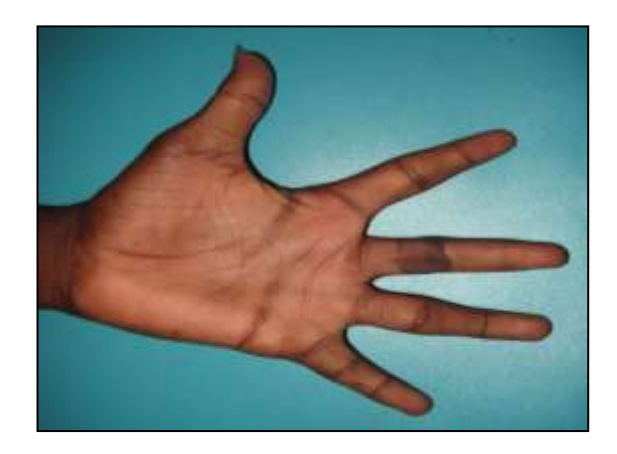
Figure 5: Late post-operative picture showing good result.

FDS contracture were released and the position maintained with 1.25 mm K-wire. (Figure 3)