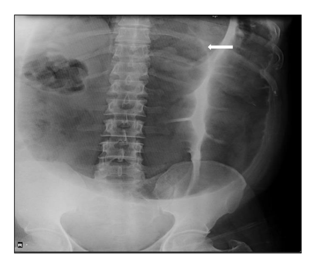
Figure 1: Erect abdominal radiograph of descending colon volvulus showing significantly dilated descending colon (white arrow) with diameter of ~ 21 cm, occupying mid and left side of abdomen.

loops are collapsed. All bowel loops showed good contrast enhancement and no signs of bowel strangulation or perforation seen. These findings were interpreted as descending colon volvulus with persistent long descending mesocolon.