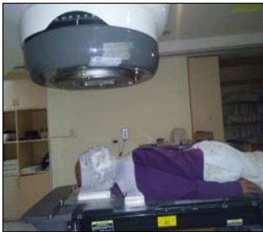
Figure 1: External beam radiotherapy by linear accelerator.

Radiation dose comprised of 30-70 Gray (Gy) delivered in 20-35 fractions (usually 1.8-2 Gy), delivered over a period of 3-6 weeks by linear acceleration, five days per week. The eye was shielded by protective shields.