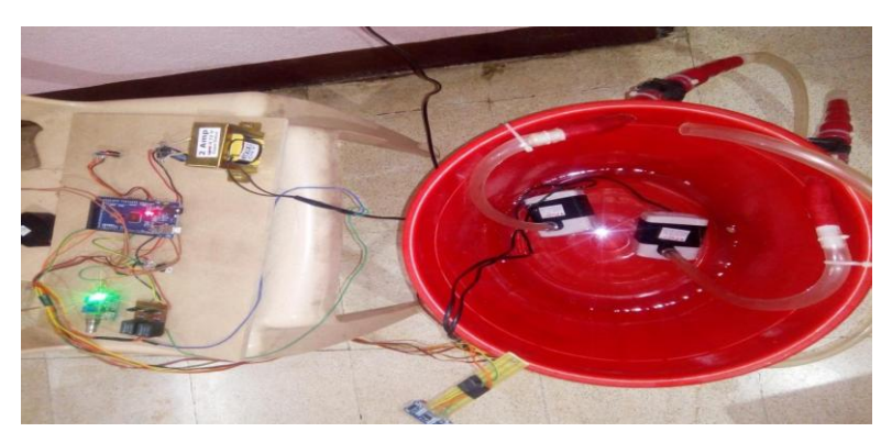
Figure 3.1 Hardware of IOT based water management system

When the supply is given to the system this signal is fed to the Arduino Microcontroller then Microcontroller process the signal and produced a desired output (Performs control action). This desired output is also transmitted by Wi-Fi transreceiver at controller side. The current status of Bin is displayed on IoT window. The required time for the complete process is few minutes.