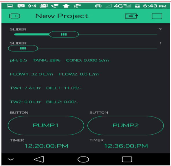
Fig 3.7 PH value of mineral water

International Journal on Recent and Innovation Trends in Computing and Communication Volume: 7 Issue: 9