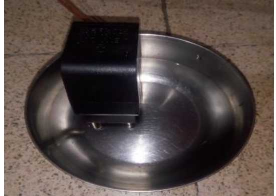
Figure 3.11 Measurement of Conductivity Sensor

Electrical conductivity is also an indicator of water quality. It measures free chlorine without sample pretreatment. It does not have messy and expensive reagents needed. Conductivity data can detect contaminants, determine the concentration of solutions and determine the purity of water. It is Compact in size. Conductivity sensor measures conductivity by AC voltage applied to nickel electrodes. These electrodes are placed in a water sample and reading is obtained.