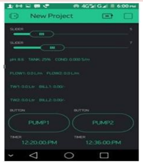
Figure 3.9 PH value above 7.5

International Journal on Recent and Innovation Trends in Computing and Communication Volume: 7 Issue: 9