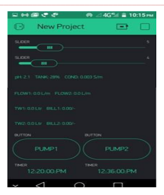
Figure 3.5 Blynk application shows the PH value

International Journal on Recent and Innovation Trends in Computing and Communication Volume: 7 Issue: 9