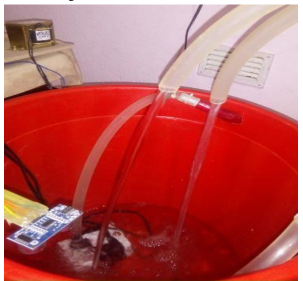
Fig. 3.8 Water flow through pipe

Here PH value show 6.5. This water is safe to drink, when water has safe PH range then only water will flow through pipe. When we press pump 1 button then through pump 1 water will flow. This procedure is same for pump 2. We can press both the pump at a time. Both the pipe is flowingwater.