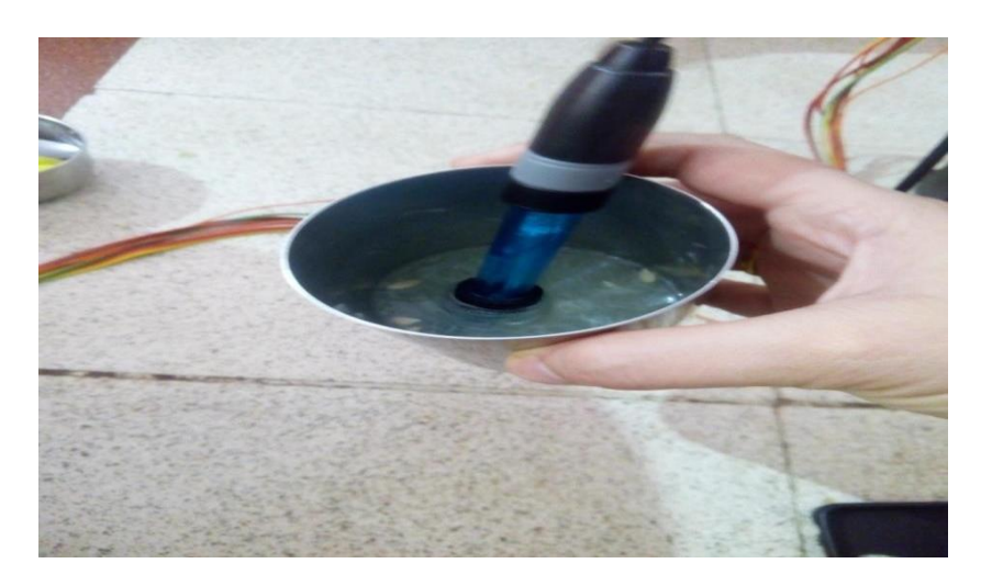
Figure 3.4 PH sensor dip into lemon juice

Lemon juice have PH value 2. When the ph sensor is dip in to lemon juice it shows the value on the blynk application.