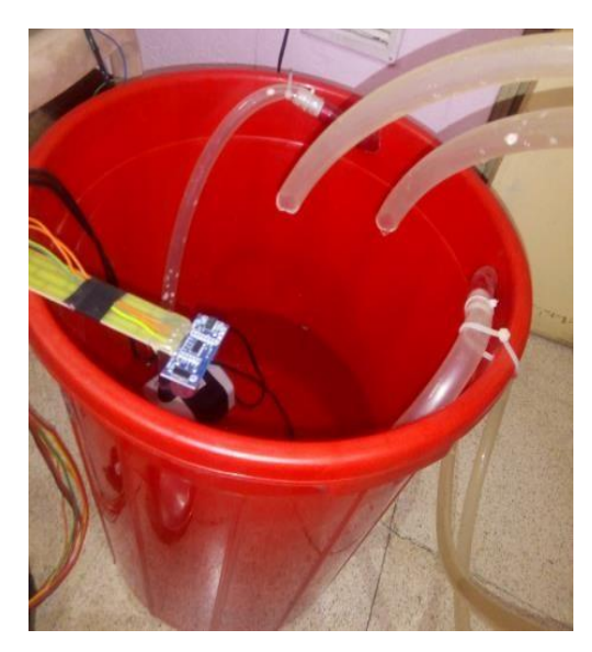
Figure 3.10 No water flow through pipe\

Here PH value shows value 8.6. This water has no drinking quality. So here also no water will flow through pipe. Higher PH Value indicates that bad quality of water. If we press pump 1 button then no water will flow through the pipe. This is same for pump 2.