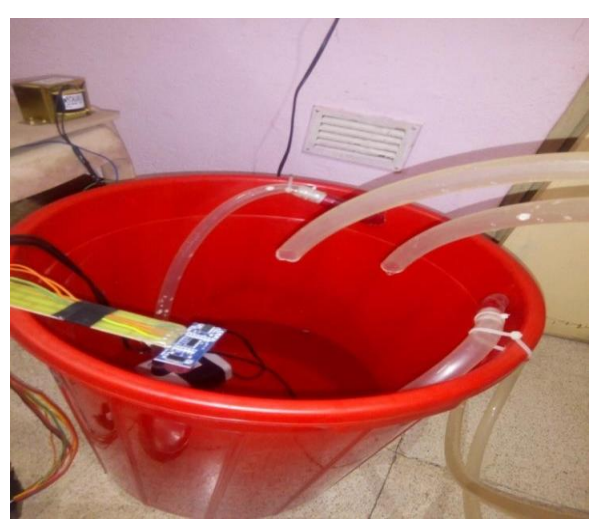
Figure 3.6 No water is flowing through the pipe

When the PH value is less than 6.5 then the flow sensor will not flow the water through the pump. This operation is done automatically. That means water will flow only when it has ideal range of PH value and it is safe to drink. It indicates alkalinity or acidity of a sample. PH value is measured in the scale of zero.