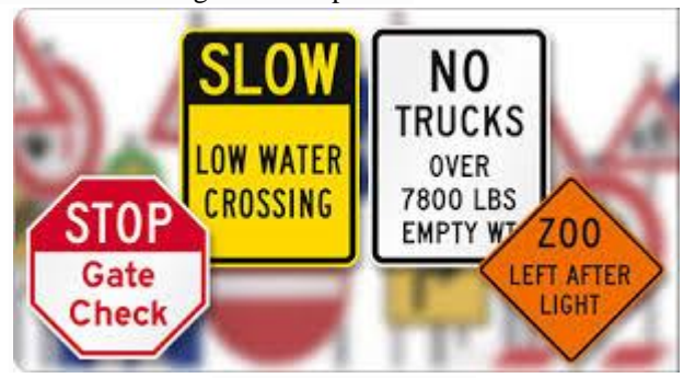
Figure 1: traffic Signs

From the outset locate the goal of TSDR is very much characterized and is by all accounts very straightforward. Lets consider a camera that is mounted into a vehicle. This camera catches a surge of pictures and the framework identifies and perceives the traffic signs in the recovered pictures. Sadly there are, other than the positive angles, likewise some negative viewpoints.