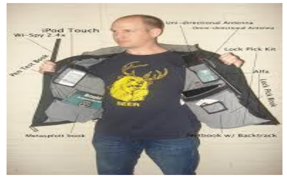
Figure 2: wearable device

In these kinds of correspondence frameworks, there are sure issues like channel portrayal, reception apparatus transmitted power. For the most part, for on-body to on body interchanges the reception apparatus must have a maximal radiation toward a path opposite to the body surface, while for an On-Body joins maximal execution is required in bearings parallel to the body surface. Subsequently, wearable receiving wires are a fundamental piece of Body driven Remote Interchanges and they are required to be reduced, little, lightweighted and with high information rates and low power utilization levels.