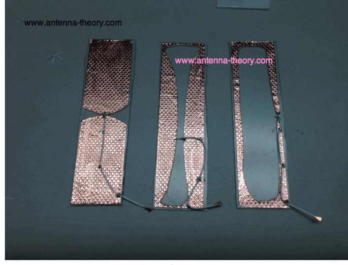
Figure 3: Design of wearable antenna

In figure 3, showing existing wearable antenna for body area networkapplication.