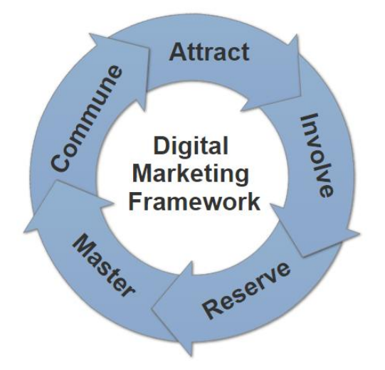
Figure 1: The Frameworks of Digital Marketing in Big Data

Grishikashvili et al., 2014 has explained the above framework (Figure 1).