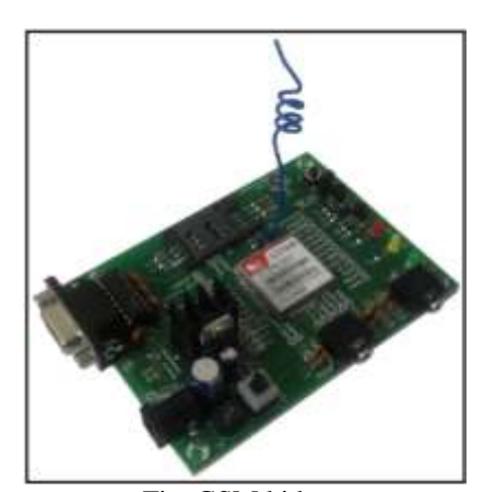
Fig. GSM kitbox

This is the most important part of the mobibush architecture. GSM is nothing but GLOBAL SYSTEM FOR MOBILE COMMUNICATION. In which GSM sim card is inserted. When farmer wants information he will send a message to gsm toolkit and gsm toolkit replies with the help of this GSM sim. Information sensed by sensors is stored on this GSM toolkit.