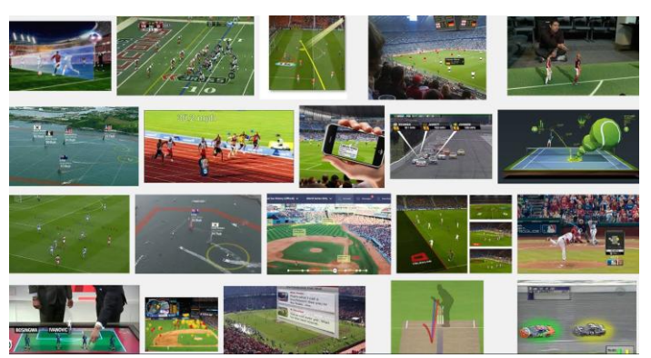
Fig. 3 Examples of using AR in sports

At the Figure 3 are shown examples of using the technology of augmented reality in sports.