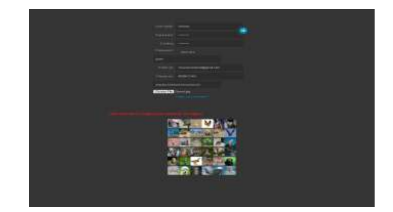
Fig.2 Registration for new user