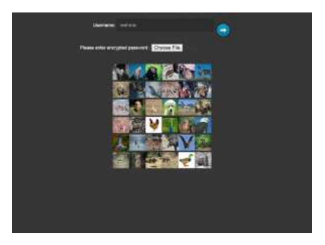
Fig.3. User Login with login history file

If both conditions is matched the access is granted to user.