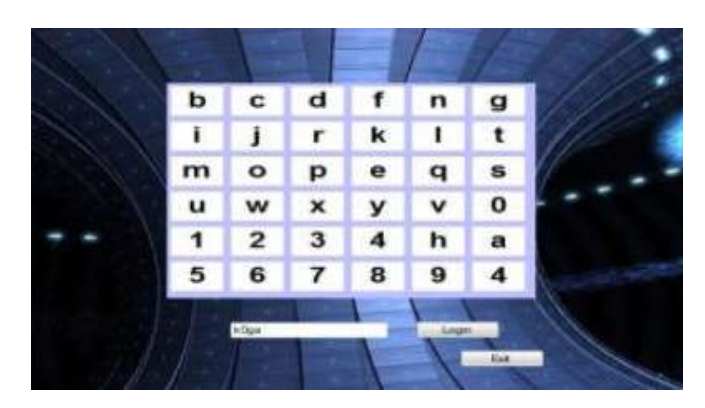
Fig1. Pair-based authentication

In pair based authentication scheme the length of the password is 8 and it should contain even number of combination of characters and numerics. An interface consists of 6X6 grid. The grid contains both alphabets and numbers, which are placed at random and the interface changes every time. The mechanism is Firstly, the user has to consider the password in terms of pairs. The first letter in the pair is used to select the row and the second letter is used to select the column in the 6X6 grid. The intersection letter of the selected row and column generates the character which is a part of the session password. In this way, the logic is repeated for all other pairs in the password. [6]