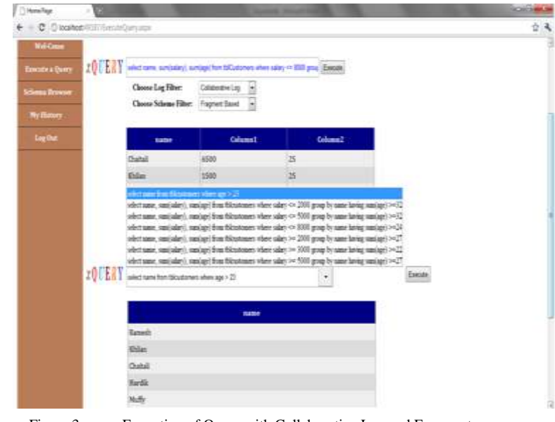
Figure 3. Execution of Query with Collaborative Log and Fragment Based Filter

User needs to first register himself for the use of this system. As shown in figure 3, after clicking on the button 'Execute a Query', user can fired a query. At the time of firing of query, user gets recommendation according to his interest. He can select any of the recommended queries to execute or he can be able to edit that query as per need.