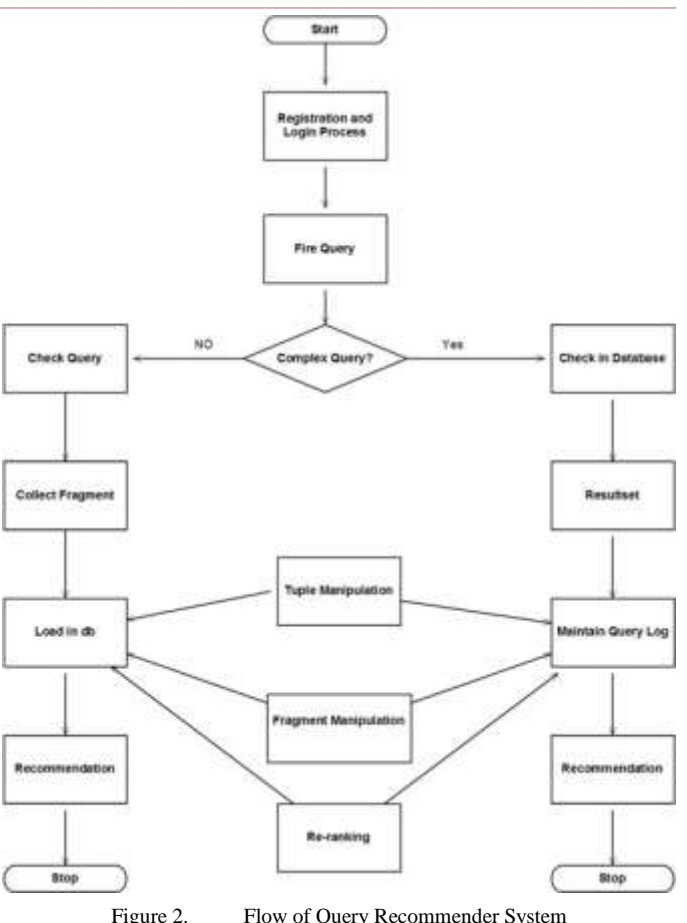
Flow of Query Recommender System

The Query recommender system recommends the query as per user interest. The flow of proposed system is as shown in fig.2.