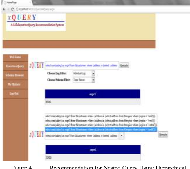
Figure 4. Recommendation for Nested Query Using Hierarchical Classificatioin