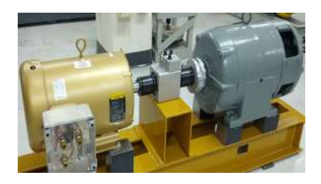
Figure 1.Doubly fed induction Generator.

DFIG is Double Fed Induction Generator, a principle used for power generation widely used in wind turbines. The concept is basically based on an induction generator with a multiphase wound rotor and a multiphase slip-ring assembly with brushes for access to the rotor windings. Delivers Better performance to permanent magnet synchronous generator.