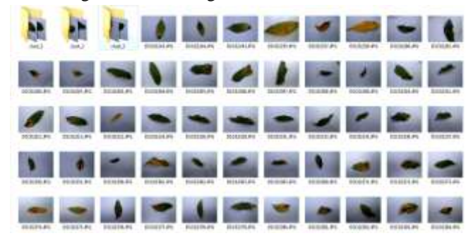
Figure 6. Clusters generated after clusteing module