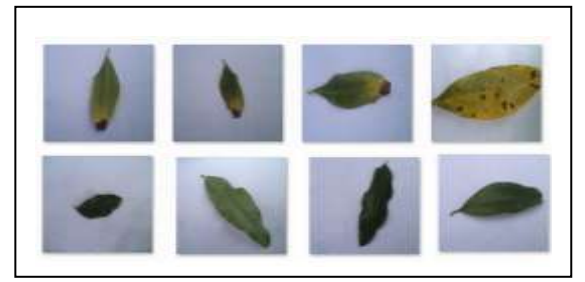
Figure 2. Sample images of diseased and non-diseased leaf

We have used a dataset of diseased and non-diseased Pomegranate leaf images. We have used 60 Non-diseased images and 190 diseased images.