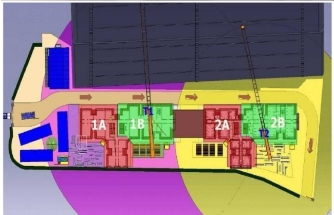
Fig. 5. The location of the two tower crane and the four bays

Model approach in projects should be used with the help of site layout planning system. Safety equipment model productivity factors are helpful to increase the productivity. Construction management can be optimized with the discussed approach and factors. To design computer model through this approach of site planning layout, this paper is discussed.