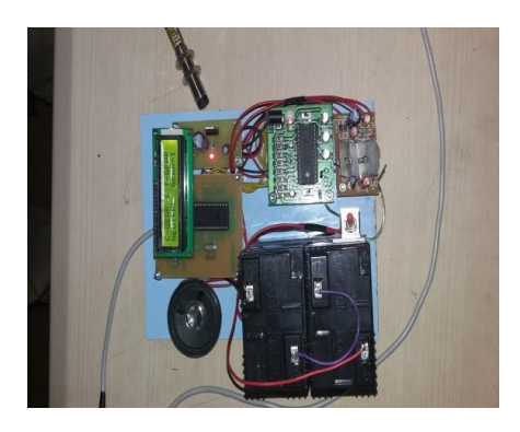
Fig.4: Working model

The circuit diagram explains about how the connections can be made in real time. The setup consists of Proximity sensor which is connected to one of the analog pins preferably for his circuit RA0/AN0 which is 2nd pin.