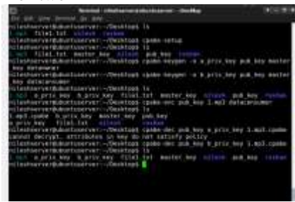
Fig. 5: Role played by CSP

The file is encrypted using the public key and various attributes of the file. The encrypted file can be decrypted and downloaded at the user side if its attributes match with the attributes used for encryption. If the attributes do not match then the error will be displayed for unsatisfiablity of attribute The Fig. 5 shows the same process of key generation for two