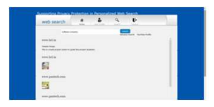
Figure3.Output of UPS Framework