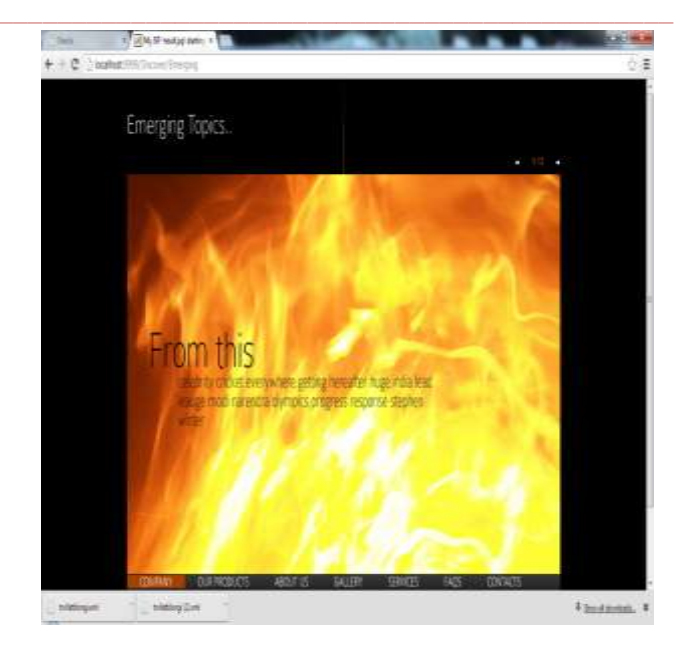
Fig.4. Emerging topics in social streams.