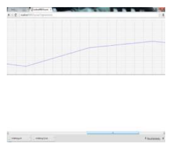
Fig. 3. Burst detection method - the number of mentions per post and the occurrence of users taking place in the mentions.