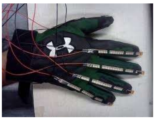
Fig.1. Data Glove

Data Glove is a device to interact with various computer systems. Consider a glove fitted with sensors and electrical wires hooked to a glove compatible computer. Here, we can move our hand inside the glove to generate the signal for computer. As we rotate or move our hand and manipulate our fingers, we can generate different types of signals to operate the computer.