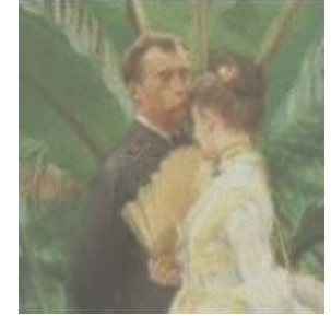
Fig. 8.2 Input Image