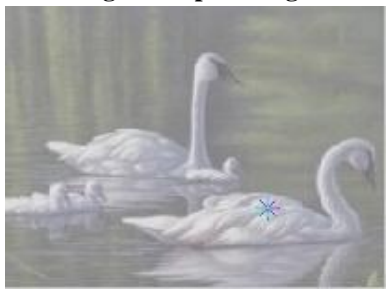
Fig.8.3 Input Image