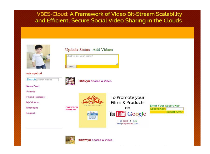
Fig 4: User Window

IJRITCC | September 2014, Available @ http://www.ijritcc.org