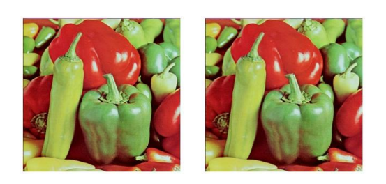
Figure 5. Peppers (a)original & (b)decompressed