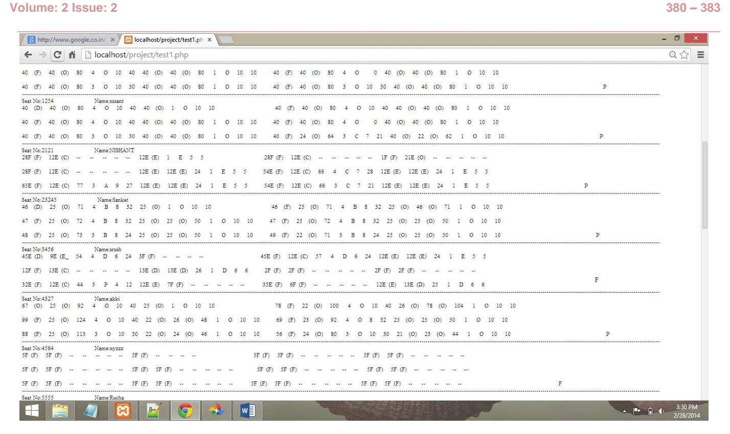
Fig.3. Screen shot of the implemented gadget sheet.

The following modules are currently being implemented: