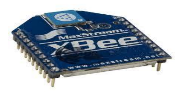
Figure 1. Zigbee

In the wireless environment, the signal strength which is sent by coordinators can be weakened as distance from it increases, causing communication with target nodes to become difficult and abuse of the wireless resources. Therefore, it is difficult to perform stable and reliable wireless communication with wide range nodes. It is not easy to use the wireless resources using location data because the coordinator cannot search the location of node. Also,