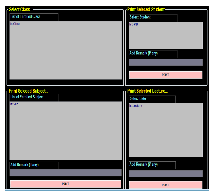
(Fig: A) Enroll Form