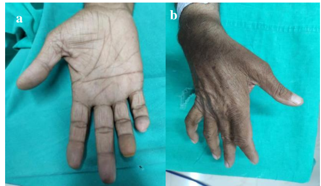
Figure 3: (a) Showing clawing of little and ring finger with wasting of hypothenar area and (b) showing wasting of first dorsal web space.

The Guyon's canal was surgically explored. The neurovascular bundle was retracted. The ulnar nerve was carefully released through the Guyon's canal. A ganglion measuring about 18x10 mm was excised. The incision was closed and a bulky dressing was applied.