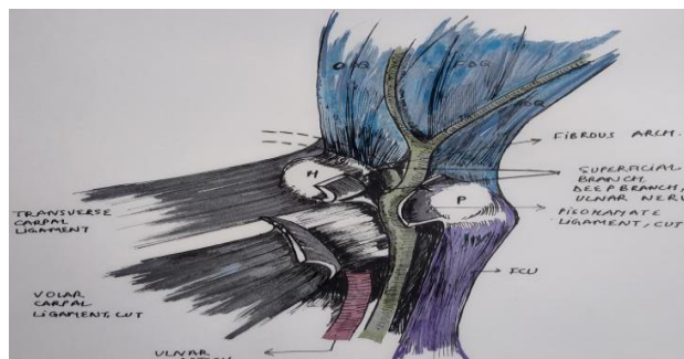
Figure 1: The ulnar nerve passes through the Guyon's canal between the volar carpal ligament and the transverse carpal ligament. ADQ, Abductor digiti quinti; FCU, Flexor carpi ulnaris; FDQ, Flexor digiti quinti; H, Hamate; ODQ, Opponens digiti quinti; P, Pisiform.

itself is a very rare cause of ulnar nerve compression in Guyon's canal. 1