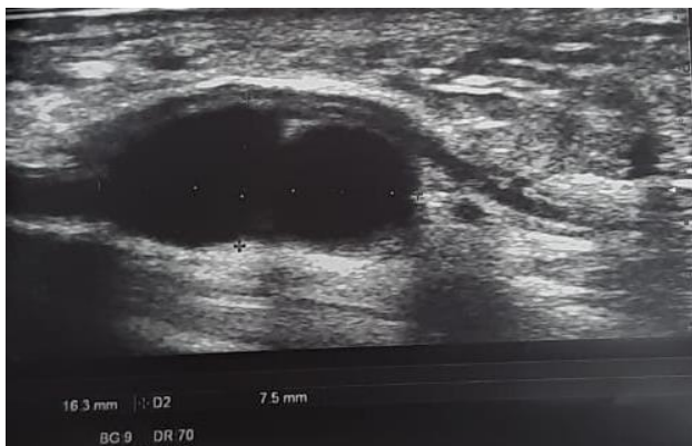
Figure 2: Ultrasound of the right ulnar nerve at the wrist level showing 16x8 mm cystic lesion compressing the ulnar nerve in the Guyon's canal.

Hypoesthesia was present along little and ring finger. Pin prick sensation was present. Two points discrimination was decreased. The patient couldn't appreciate upto 14 mm. Ulnar nerve was tender at the wrist.