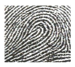
Figure 3: Loop Pattern

Loop: The ridges enter from one side of a finger, form a curve, and then exit on that same side.