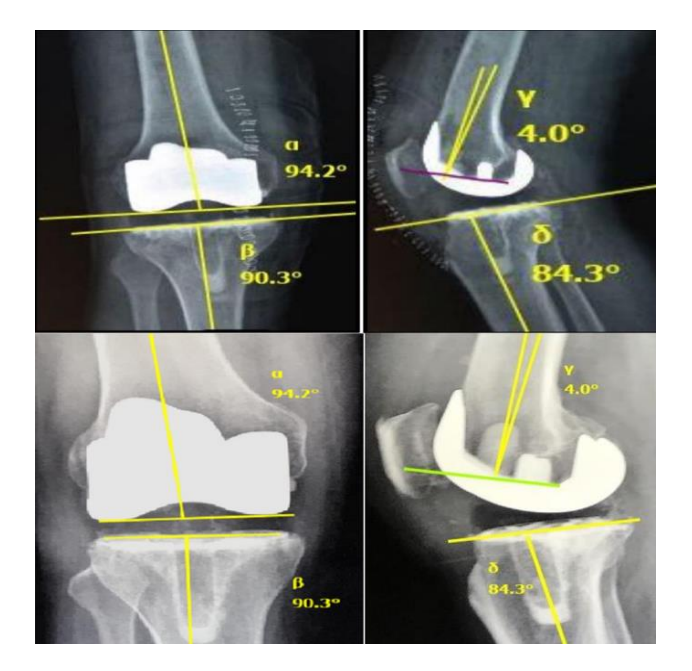
Figure 1: Method for calculation of component alignment angles on anteroposterior and lateral Xrays both immediate and 5 year postoperative.

According to protocol, all patients were mobilized full weight bearing from day one post-operatively. At 5-year follow-up repeat knee functional scoring and VAS scoring was done. Radiological investigation in the form of X-ray knee (anteroposterior and lateral views) was done both immediate postoperatively and at 5-year follow-up. Alignment of the TKA components were calculated on the X-ray as per American knee society recommendations. Angles were labeled as alpha ( \alpha ), beta ( \beta ), gamma ( \gamma ) and delta ( \delta ) angles which determine femoral component varus/valgus, tibial component varus/valgus, femoral component flexion/extension and tibial slope respectively.<sup>11</sup> (Table 1, Figure 1).