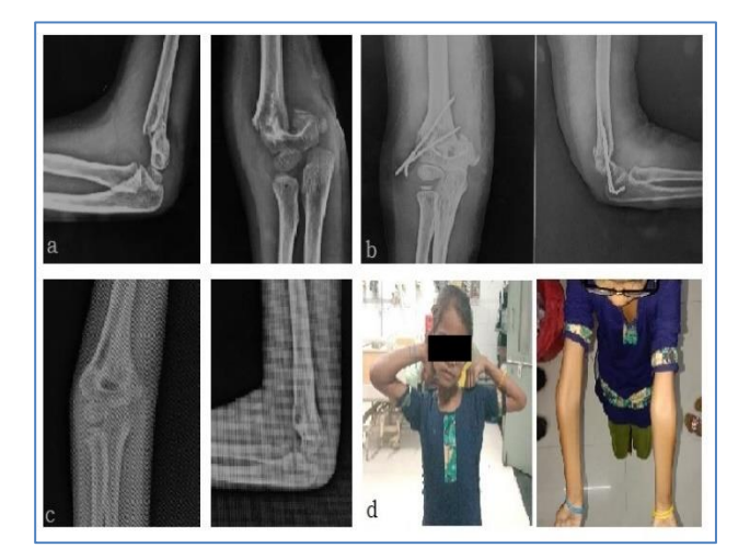
Figure 4: (a) Pre-operative radiograph of a fair outcome lateral only pinning case, (b) post loss of reduction radiograph of a fair outcome lateral only pinning case, (c) follow-up radiograph of a fair outcome lateral only pinning case and (d) clinical photograph of a fair outcome lateral only pinning case.

They were revised with close reduction and percutaneous pinning. Both had fair functional outcome and cosmetic outcome was fair in one and good in the second. 5 (27.8%) cases showed mild displacement, one (5.6%) showed major displacement as per Skaggs criteria. Figure 3 shows radiographs and clinical photograph of a 4 years old child operated with lateral only pinning with excellent radiological and functional outcome.