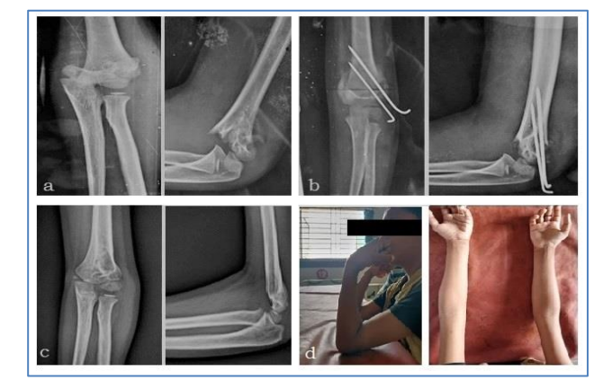
Figure 2: (a) Pre-operative radiograph of TOF-FCP pinning case, (b) post-operative radiograph of TOF-FCP pinning case, (c) follow-up radiograph of TOF-FCP pinning case and (d) clinical photograph of TOF-FCP pinning case.

The average time to clinico-radiological union in this fixation was four weeks. Pin tract infection of very mild nature was detected in 4 patients. Four cases showed mild displacement as per Skaggs criteria on assessment of follow up Baumann's angle without secondary displacement shows radiographs and clinical photograph of an 8 years old child operated with TOF-FCP pinning with excellent radiological and functional outcome (Figure 2).