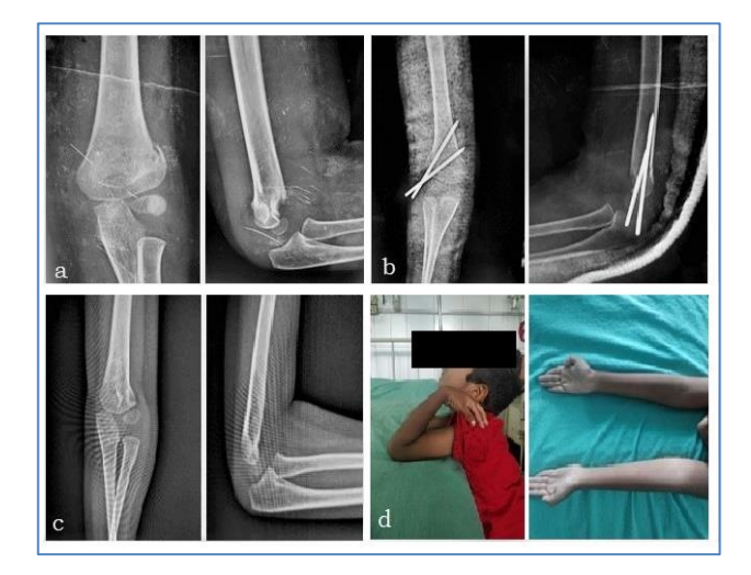
Figure 3: (a) Pre-operative radiograph of lateral only pinning case, (b) post-operative radiograph of lateral only pinning case, (c) follow-up radiograph of lateral only pinning case and (d) clinical photograph of lateral only pinning case.

The average time to clinico-radiological union in this fixation was 4.2 weeks. Pin tract infection of very mild nature was detected in 6 patients, in one of those case it was the cause of elbow stiffness in the early follow up. In one patient, both the wires were crossing too close to fracture site leading to secondary displacement and in one patient one of the wires became unicortical post-operatively leading to secondary displacement due to inadequate fixation.