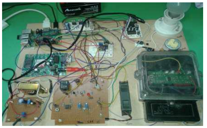
Figure 2..Node section of Energy Management in smart Grids using Embedded System & IOT

In above circuit diagram used LDR for light measurement. Here 10K resistor is used as base resistor for transistor it limits the current & allows 2ma Current to flow through LDR. It also used 10K variable resistor using this resistor the value is varied LDR using this.BC547 is used for amplification. The analog output from sensor is given to the ADC MCP 3008 pin no3 i.e. ch3 which converts i.e. analog signal to digital .Output of ADC is then given to the raspberry Pi GPIO9.Power supply required is 5v Dc supply voltage.