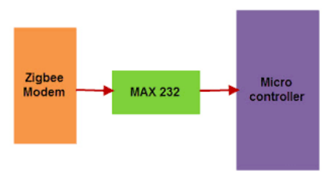
Figure 2. ZigBee Interface with microcontroller

ZigBee is a cheap, power efficient and wireless mesh networking standard. The low cost allows this technology to be widely implement in wireless control and monitoring applications, the low power requirement allows a longer life with the small size batteries, and the mesh networking provides high reliability and larger range with simple network. ZigBee has been designed to meet the growing demand for capable wireless networking between numerous low power devices.