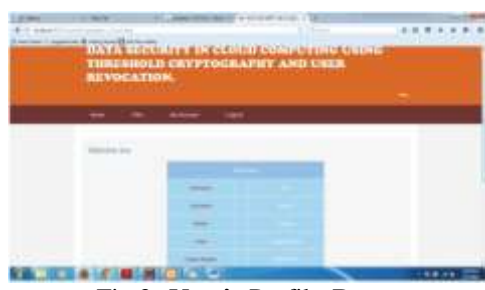
Fig.3. User's Profile Page