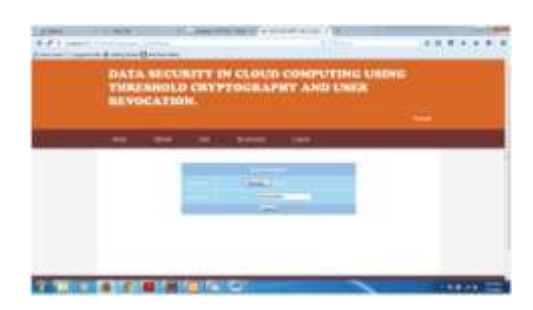
Fig. 5. Page to Upload Files on Cloud