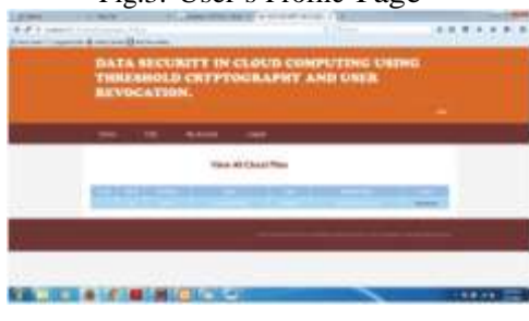
Fig. 4. List of Files Uploaded on Cloud