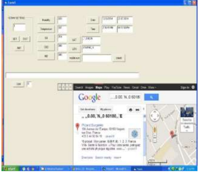
Figure 4: VB frame

After the data has been processed by PIC and transmitted over the GSM, it is fed to the database and the pollutant levels are displayed on the front end created in visual basic. The following figure 4 is of a VB frame showing the pollutant levels.