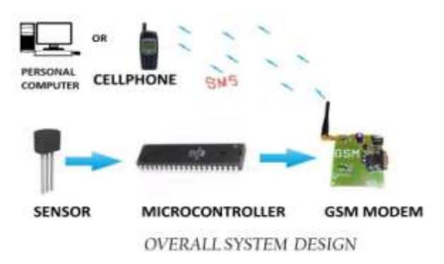
Figure 1: System model

Our air pollution monitoring System is an automated version of monitoring the quality of air and sending the information to a distant database wirelessly. Our system has got almost all things automated so that we get an advantage of this concept ie the real time direct measurement of the air quality through GSM/PC. Maintaining backup of sent data is easy and can be done within a few seconds. This model uses gas sensors, GSM module (SIM900), LCD JHD 162A and a PIC 16F877 microcontroller. The GSM module is connected to PC through RS232 cable.