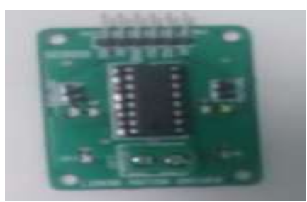
Figure 2.3.L293D Motor Driver.

It is a driver circuit which allows the rotation of both the motors simultaneously either clockwise or anticlockwise direction. This contains 16 pins but when soldered on printed circuit board then only 6 pins are used for its functionality. It takes the signals from the microcontroller, amplifies it to enhance its power and then send it to motors. It needs power supply of 5volts supplied by microcontroller. Since microcontroller supplies only 5 v but motor operation needs power supply of 12v hence motors cannot be directly controlled by the microcontroller. It provides power supply of 12v to the motors with the help of external source. Fig. 2.3 shows driver circuit.