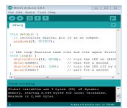
Figure 2.2. Arduino IDE.

Arduino IDE is used to program the arduino microcontroller according to the requirement. Arduino IDE is windows based software written in java. Its programs are divided into three parts. First one includes declaration of Pins, second is about specifying the mode as 'input' or 'output', third one is about writing the values on it. Fig. 2.2 shows arduino windows based software to program the microcontroller.