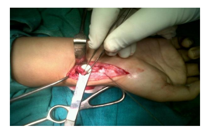
Figure 2: Intra-op clinical photograph showing Schaphoid being initially stabilized with guide wire and pronator quadratus muscle pedicle harvested.

for another month. At 2 months, union is evaluated with radiographs and, in case of doubt, tomograms. The wrist is braced in a functional position for another 1 to 2 months, and then active exercises are begun.