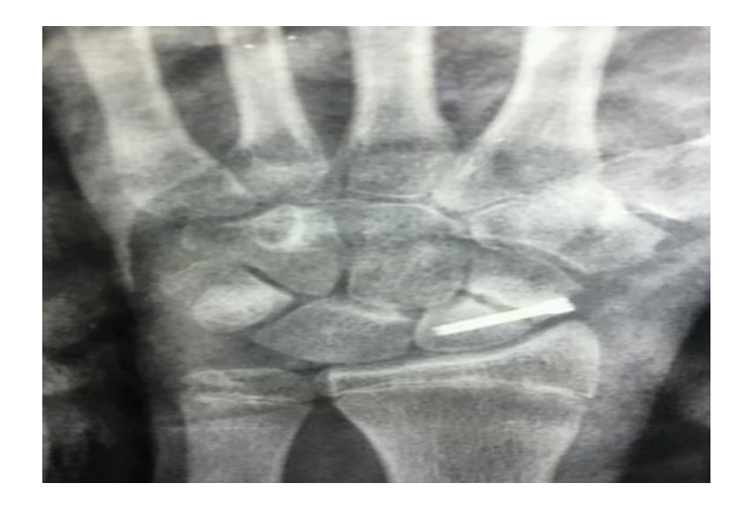
Figure 3: Post-op X-ray showing fixation with Herberts screw.

Figure 2: Intra-op clinical photograph showing Schaphoid being initially stabilized with guide wire and pronator quadratus muscle pedicle harvested.