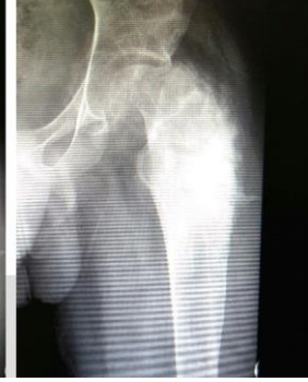
Figure 8: X-ray after two weeks of fixator removal shows adequate joint space and well reduced hip joint.

Mobilization exercise was carried out after mobilization under anaesthesia by our physiotherapist. X-ray taken two weeks after mobilization (Figure 8) showed adequate joint space with well reduced hip joint.