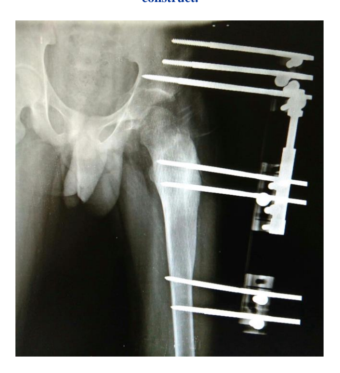
Figure 4: X-ray showing adequate distraction with subluxation of hip joint at the end of second month.

Distraction was started at the rate of 0.5 mm twice a day. Serial radiographs were taken at 2 weeks, 4 weeks and 6 weeks. Distraction was temporarily deferred for few days for pain relief. X-ray taken at 2 months from the date of fixator application demonstrated 2.5 cm distraction of the hip joint along with inferior subluxation of femoral head. There was no evidence of pin loosening (Figure 4).