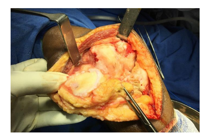
Figure 2: Intraoperative image showing hypertrophied synovium and eroded joint surface.