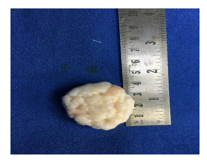
Figure 3: Gross appearance is that of a multilobulated synovium with multiple white or bluish nodules that are composed of hyaline cartilage attached to the synovium of varying size.