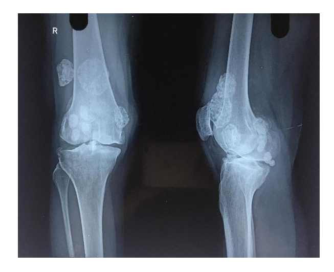
Figure 1: Antero-posterior, lateral x-ray of right knee showing multiple loose bodies.

Figure 4 shows microscopically, the metaplastic synovium shows cartilaginous nodules beneath the surface lining of the synovial membrane. They may be highly cellular and of moderate pleomorphism. The nodules are variably cellular with the chondrocytes seen in clusters, a very characteristic finding.