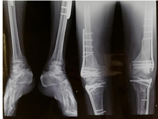
Figure 4: Final follow up at 7 months.