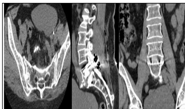
Figure 2: CT-scan with anterior cage migration.

In the immediate postoperative period, the patient was kept in absolute rest for 3 days and its hemodynamic status and hemoglobin were monitored.