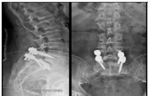
Figure 1: Post-operative X-ray with anterior cage migration.

This surgery took place one week later, through an anterior retroperitoneal approach, with the help of a vascular surgeon. It was found that the cage had migrated through the posterior wall of the confluence of the left internal and external iliac veins. The cage was successfully extracted and the vein was immediately repaired with direct suture by the vascular surgeon. There was a decrease in the hemoglobin level, from 13.4 to 9.3 g/dL, but no need for blood transfusion.