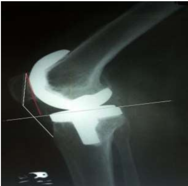
Figure 4: Postoperative X-ray.

If the Blackburne Peel index was more than 0.54, only then further calculation of Insall Salvati ratio was done and recorded. 28 Patella baja was defined as Insall Salvati ratio less than 0.8 or a decrease in length of the patellar tendon by 10% or more of preoperative value. 12,19