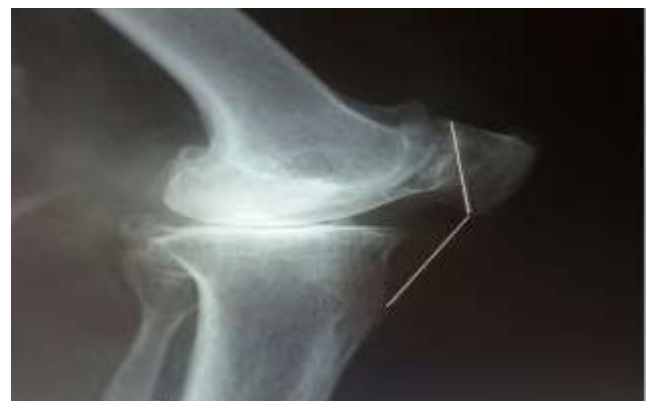
Figure 3: Preoperative X-ray.