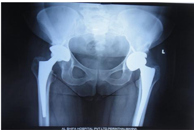
Figure 5 (B): 9 years follow up.