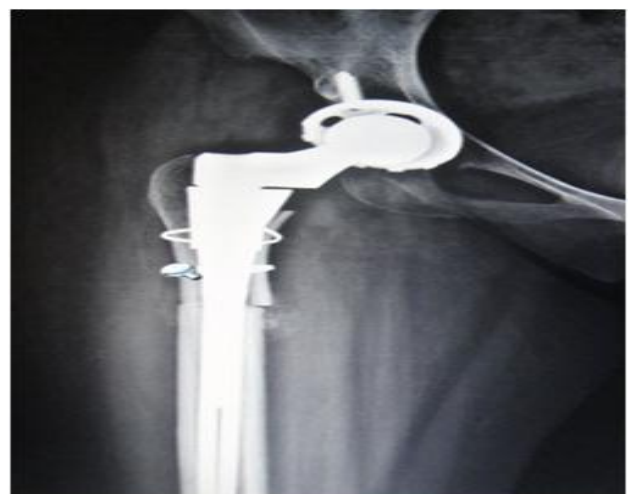
Figure 6 (C): Post operative S ROM stem with subtrochanteric shortening osteotomy.