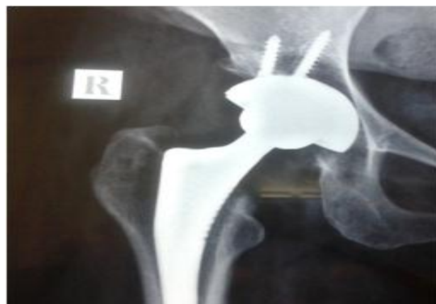
Figure 2 (B): Post operative.