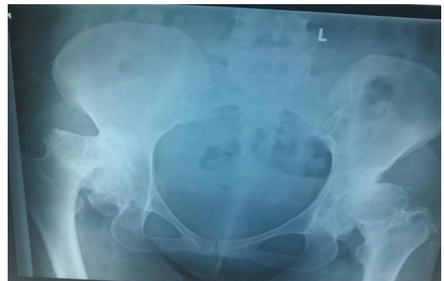
Figure 4 (A): Bilateral DDH- Crowe typeIII (right) type I (left).

A 30 years old female presented to us with limping and pain in bilateral hips. The pain was since four years more in right hip which was limiting her activities of daily living. X-ray showed Crowe type III DDH in right hip and Crowe type II DDH in left hip with advanced arthritis in both hips (Figure 4A). This patient was operated early in our series. Challenges here include high hip dislocation in right hip, deficient anterosuperior acetabular wall and huge medial osteophytes. We planned uncemented THA in right hip first and left hip was operated 2 months later. In both hips, we aimed at anatomical hip center and reconstructed superior acetabular wall which is optional but it helps in a future revision (Figure 4B). Primary stability of the cup was ensured by good anterior-posterior purchase. When we are not reconstructing the superior wall up to 30% of the cup can be safely left uncovered. A high hip center up to 2CM is acceptable in such cases. Again postoperative protocol was same as case 1 at 7 years follow up she is doing well. Similar case with bilateral hip DDH Crowe type III in right hip and type II in left hip (Figure 5A). Here we accepted a high hip center in right hip( Figure 5B). Postoperatively no nerve palsy noted and at 9 years the post-op patient is doing well.