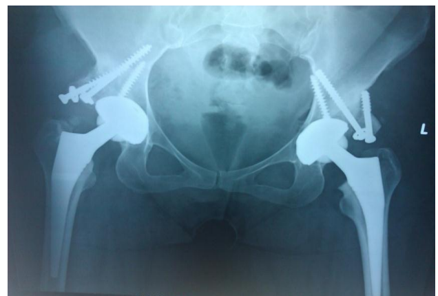
Figure 4 (B): 7 years follow up.