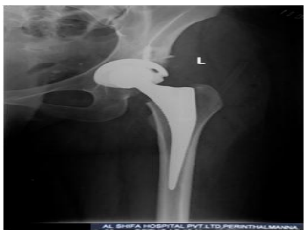
Figure 1 (B): Post operative.