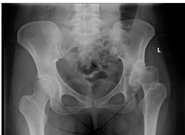
Figure 1 (A): Crowe type II DDH left hip.

A 28-years-old female presented to us with limping since childhood and pain in left hip for 2 years. The pain was insidious in onset and gradually progressive serious enough to limit her activities of daily living. X-ray showed Crowe type two DDH left hip with arthritis (Figure 1A). This is a milder form of the disease and the challenges in this patient for total hip arthroplasty were coxa valga and deficient anterior superior acetabular wall. Here we planned for uncemented THR with oxyinium on poly bearing surfaces using standard implants, did preoperative templating. Our aim was to go to the anatomical hip center. So hip center was brought down and the cup was medialised (Figure 1B). The offset was restored by a high neck cut and using standard offset stem. The patient was made ambulant on 2 nd postoperative day with partial weight bearing using a walker for one month and full weight bearing with a cane for 1 months. At one year follow up the patient is doing well.