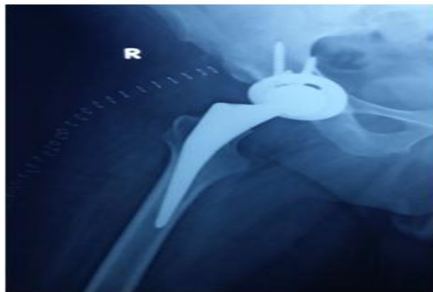
Figure 3 (C): Post-op x-ray note the anteverted cup insertion, controlled cotyloplasty done to get stability, proud insertion of femoral stem to restore offset.