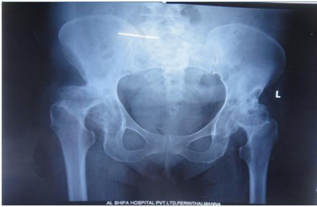
Figure 5 (A): DDH- Crowe type III (right), type II left hip.