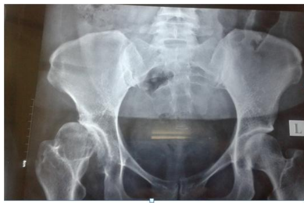
Figure 2 (A): Crowe type II DDH right hip.

Another patient (Figure 2 A and B) a 38-year-old female presented to us with Crowe type II DDH. We could restore the anatomy with a similar procedure.