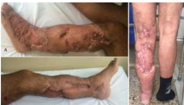
Figure 4: A) lateral, B) medial and C) posterior clinical appearance of the leg 3 months after the initial admission.

However, immunofluorescence microscopy could not be performed, and the disease subtype was not determined. The patient consulted with the dermatology clinic after surgery. Corticosteroid treatment was applied at 3×500 mg/day over 3 days with intervals of 5 days. Cultures taken from deep soft tissue and fascia revealed no organisms present. After the corticosteroid regimen, the lesions regressed, and routine kidney function tests were within the normal ranges. Daily dressing and debridement of the remaining lesions were performed with the help of plastic surgeons over the following days. After 45 days of follow-up, all of the lesions were remediated, and the patients' routine kidney function tests were within the normal ranges as given in Figure 4.