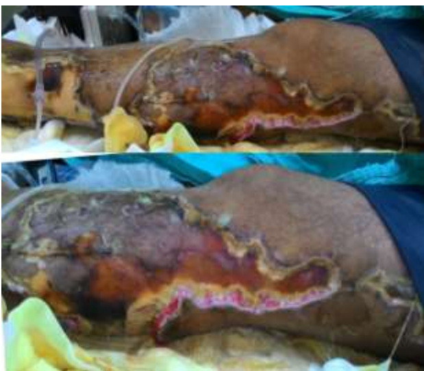
Figure 1: Clinical appearance of cutaneous lesions on the lateral aspect of the left leg 1 week after the initial admission.

There were wide, erythematous, ulcerative and bleeding skin lesions starting from the anterolateral aspect of the left thigh and extending to the ankle. The lesions were not continuous, and healthy skin areas were present between the lesions as in Figure 1.