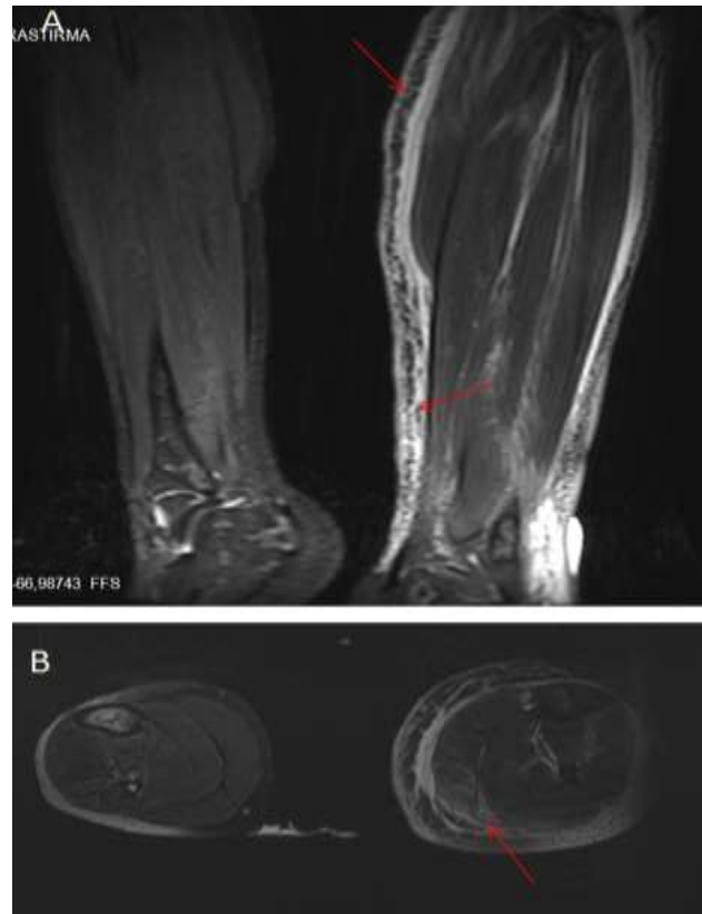
Figure 2: A) STIR coronal MRI; red arrows showing subcutaneous edema. B) T2-weighted axial MRI; the red arrow shows oedematous involvement at the musculature and interfascial plane.

There was no crepitus on the skin. The popliteal artery, dorsalis pedis artery and posterior tibial artery pulses were palpable. Conventional radiographs of the patient revealed no subcutaneous gas areas or erosion on the bones. Doppler ultrasound of the arteries demonstrated normal flow in all arteries. Magnetic resonance imaging (MRI) demonstrated suspicious oedematous involvement in subcutaneous areas as shown in Figure 2.