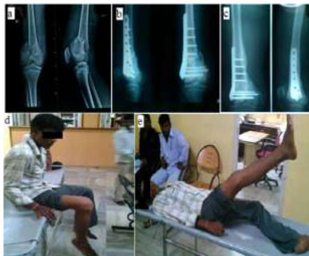
Figure 3: Case study. (a) Preoperative; (b) Immediate postoperative; (c) 6 months follow up (d) Knee flexion; (e) knee extension.

knee extensor lag was 2.4 degrees. Functional outcome at the end of 5 to 7 months (mean of 6 months) was assessed using NEER's scoring system. Results were excellent in 17 patients (57%), good in 8 (27%), fair in 2 (6%) and poor in 3 (10%). In our study, functional results are better than that of non-locking condylar plates and close to the functional results achieved in other LCP studies so are the rate of complications.