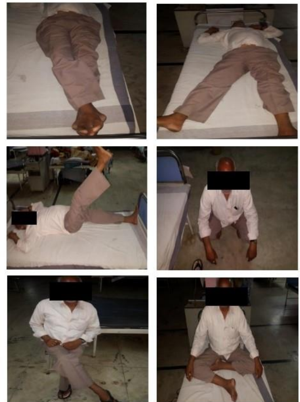
Figure 6: Clinical photographs of patient who underwent unipolar hemiarthroplasty performing various hip movements, squatting and sitting cross leg at 2 years follow-up.

There was one death in unipolar and two death among cemented bipolar group. All three patients completed minimum 6 months follow up before death and HHS before death was good (all between 80-89). So, the cause of death could be attributed to the comorbidities they had.