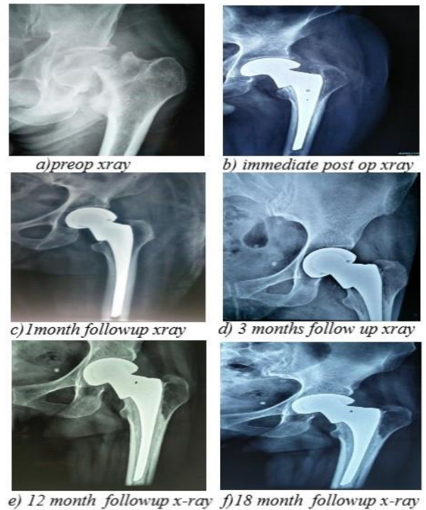
Figure 3 (a-f): 62 year old male with fracture neck of femur right under went cemented bipolar hemiarthroplasty.

static quadriceps exercise, ankle and toe mobilization, pelvic lift exercises, abductor strengthening exercises is given. Postoperative HHS is assessed and patient is discharged with advice to follow up 6 weeks after surgery or earlier in case of a problem.