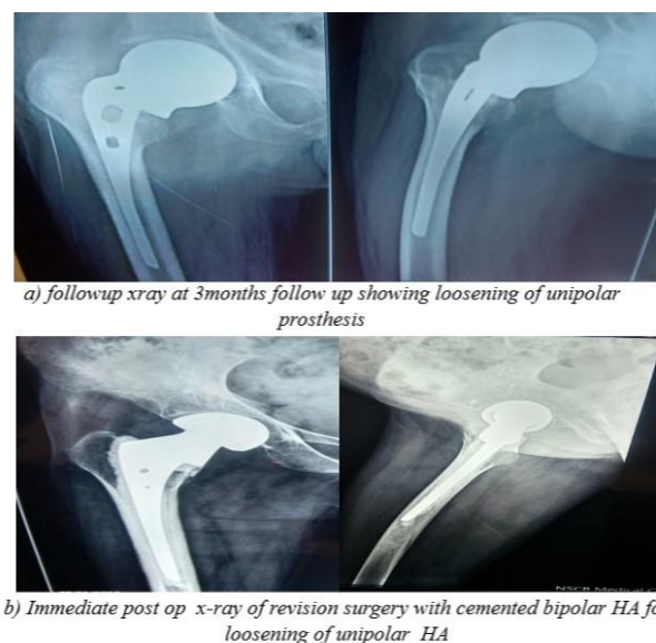
Figure 4 (a and b): 60 year old male with fracture neck of femur right under went uncemented unipolar hemiarthroplasty.

Serial follow-up X-rays at various time intervals.