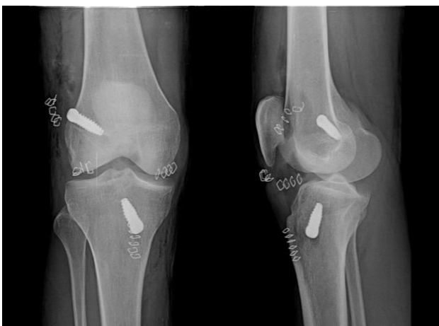
Figure 4: Postoperative X-ray.

Immediate postoperative X-rays were taken to assess the fixation parameters (Figure 4).