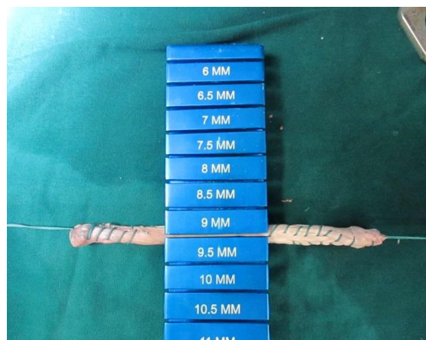
Figure 2: Allograft whipstitched and measurement.

The allograft was thawed for at least 30 mins following which the vacuum seal was opened and the tendon washed with 2liters of normal saline and 80mg of Gentamicin. Ends were whip stitched with a no. 2 non-absorbable Ethibond suture material and the graft size was measured (Figure 2).